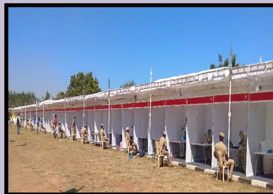
61 st All India Police Duty Meet, February, 2018 at Chennai